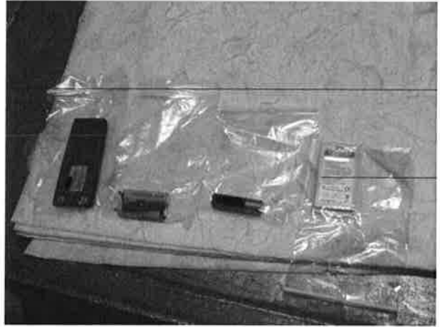
(Individually packaged batteries to prevent short circuits)

All batteries must be packaged for transportation in a manner that prevents short circuiting and damage to the battery or its terminals. This may be achieved by packing each battery in fully enclosed inner packagings made of non conductive material or separating the batteries from each other and other conductive material in the same package and pack to prevent damage and shifting while in transport.