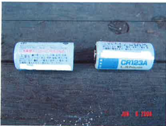
(Primary lithium batteries with unprotected terminals)

Common violations and safety problems noted during these investigations include: