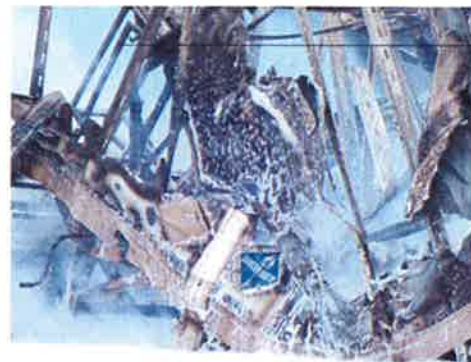
(July 2008 truck fire in Jackson, MI)

The following is a brief summary of the requirements that apply to ground shipments of batteries for recycling or disposal. These requirements also apply to shipments of batteries from battery manufacturers, equipment manufacturers, distributors and retail sales outlets. While additional requirements apply to air shipment of batteries PHMSA is not aware of used batteries being shipped by air.