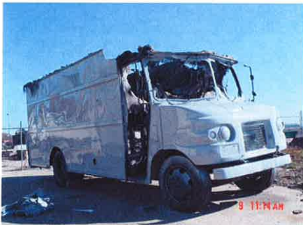
(November 2006 truck fire in Galesburg, IL)

DOT encourages and supports the safe recycling and disposal of used batteries. However, we take an aggressive approach to swiftly investigate and enforce the safety requirements in the HMR for complaints and transportation incidents such as the parcel carrier delivery truck battery incident in November 2006.